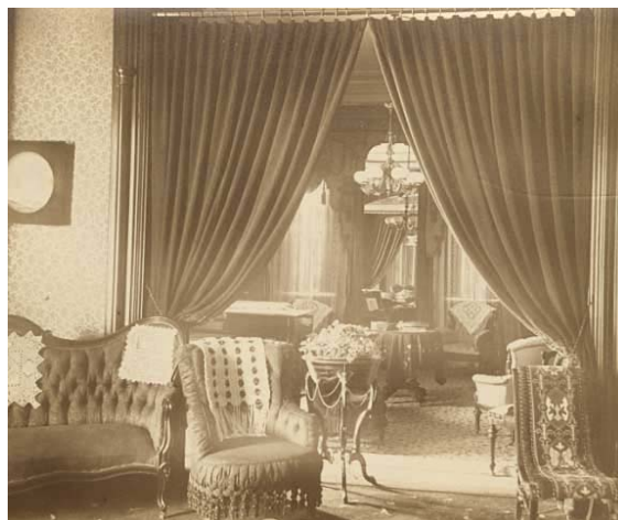
Reception room from library, Ramsey house, 1884 MHS Photograph Collection Location no. MR2.9 SP3.2gr p47 Negative no. 5547

A photograph of the furniture as it was originally arranged in the reception room of the Alexander Ramsey house is shown here.