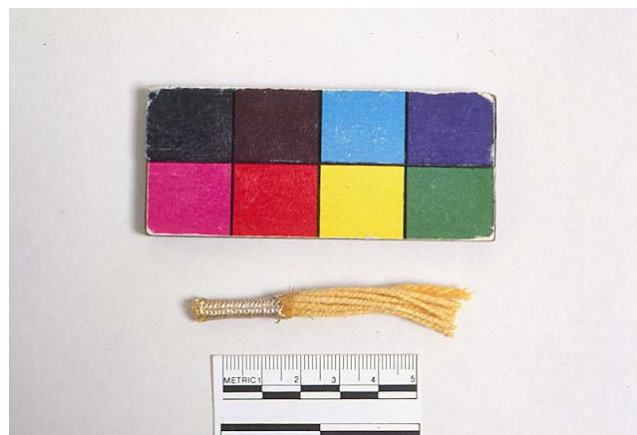
Figure 6. The section of the new cord showing the interior cotton warps.

A new #41 sword knot cord and acorn were purchased from Legendary Arms Co. (Flemington, N.J.). The surfaces of the new cord weaving were coated with cellulose nitrate lacquer during the manufacturing process. The surface of a section of the new metal and cotton warps were coated with 1:1 Acryloid B-72 in acetone prior to cutting to consolidate it as the braiding was relatively loose compared to the original cord. A section of the new cord was cut with a new scalpel blade. The section was slit lengthwise to open the weave.