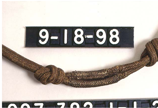
Figure 8. Detail of the completed fill.

The loose metal threads on the new sections were trimmed at either end with a scalpel. The patch was properly tinted with acrylic-based paints in order to blend in with the surrounding surface colors. Two main areas were filled in this manner. The original cords were reshaped manually.