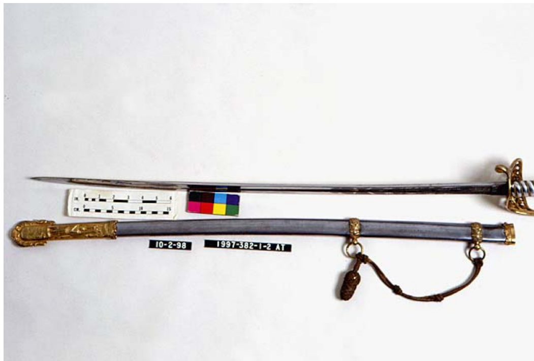
Figure 10. Sword and Scabbard after treatment.

The metal components were degreased with acetone to remove fingerprint residues and other oil-based dirt. Acidified thiourea solution was used to reduce and remove tarnish. The parts were rinsed with deionized water and polished with aluminum oxide paste. The polish residue was removed with acetone. The copper alloy parts were coated with 3% v/v Inctalac in toluene to retard future tarnish accumulation. The steel components were coated with 3% Acryloid B48N, v/v, for the same reason.