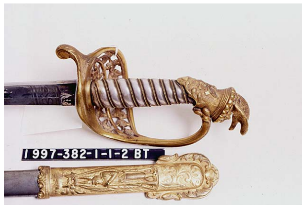
Figure 3. Detail of the pommel and hilt.

The brass eagle pommel cap is fitted to a nickel silver handle wrapped with brass wire.