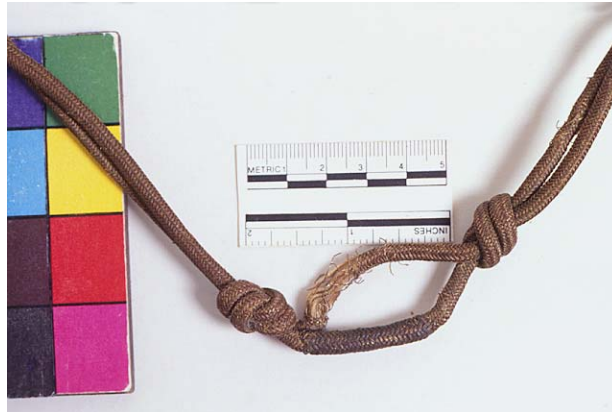
Figure 7. The original cord during preparation for the new section fill.

The loose metal threads on the new sections were trimmed at either end with a scalpel. The patch was properly tinted with acrylic-based paints in order to blend in with the surrounding surface colors. Two main areas were filled in this manner. The original cords were reshaped manually.