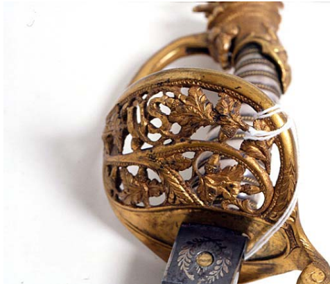
Figure 2. Detail of basket-type guard.

The brass eagle pommel cap is fitted to a nickel silver handle wrapped with brass wire.