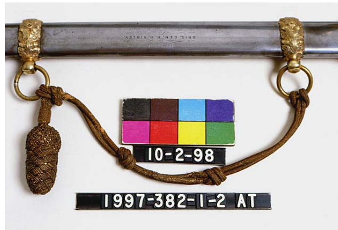
Figure 9. Detail of the conserved cord and acorn.

The metal components were degreased with acetone to remove fingerprint residues and other oil-based dirt. Acidified thiourea solution was used to reduce and remove tarnish. The parts were rinsed with deionized water and polished with aluminum oxide paste. The polish residue was removed with acetone. The copper alloy parts were coated with 3% v/v Inctalac in toluene to retard future tarnish accumulation. The steel components were coated with 3% Acryloid B48N, v/v, for the same reason.