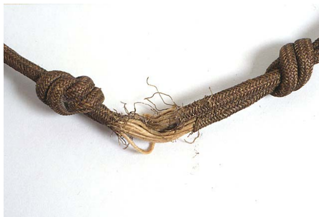
Figure 5. Sword knot showing loss in metal threads due to abrasion and stress during use and handling.

The overall condition of the sword and scabbard was stable and good. There was generalized tarnish on the brass and nickel-plated components. The sword knot, however, was in poor and unstable condition. The metallic threads were broken in five areas on one of the strands of the cord, and the interior cotton warps were exposed. The acorn was completely missing from the end of the cords. The existing bullion cordage is darkened from abrasion and soiling.