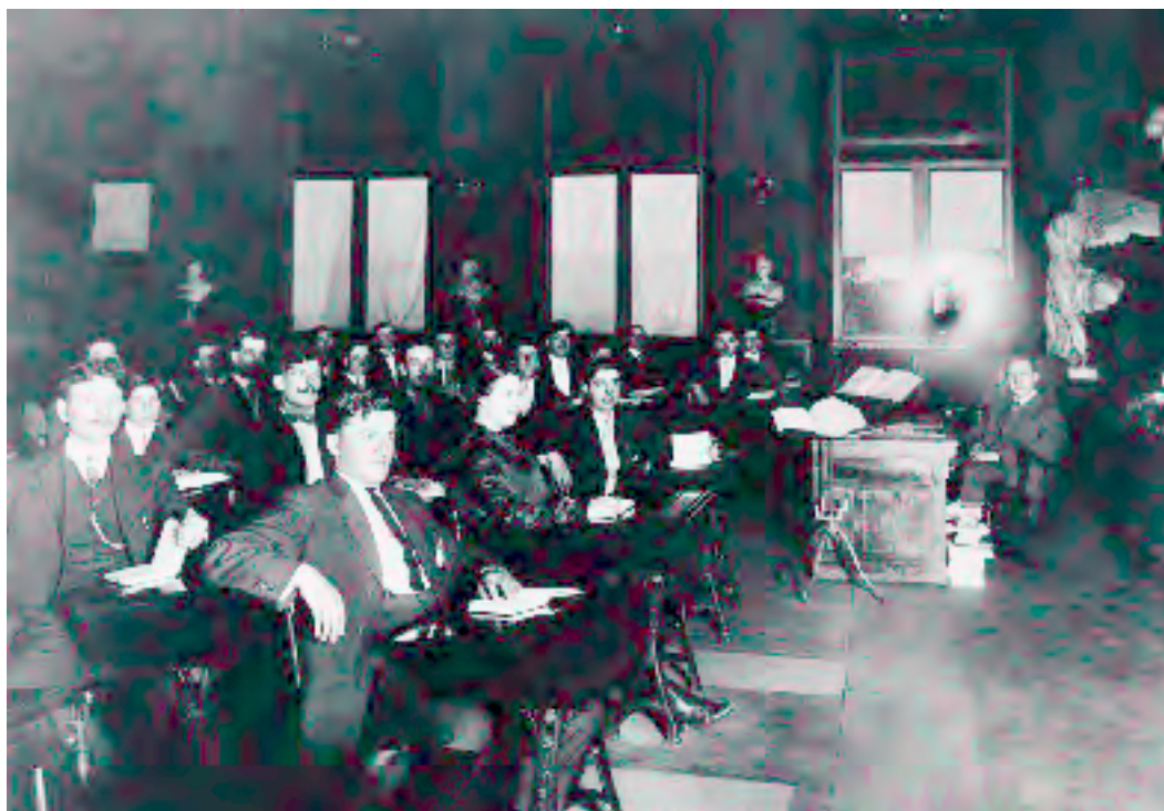
Winged Victory and inspirational busts adorn this night-school class for immigrants, sponsored by the Oliver Iron Mining Company in Eveleth, about 1895.