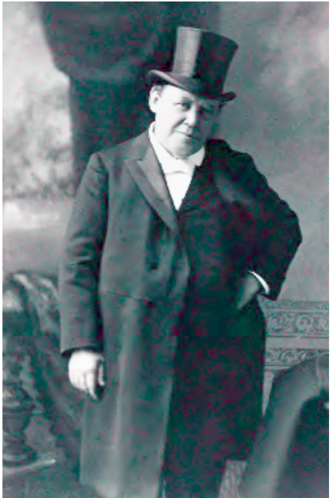
Ignatius Donnelly, Nelson’s political rival, 1890s

The issue of Nelson’s ethnicity did not fade with his election. “Governor Nelson,” asserted St. Paul’s North-Western Chronicle , “seems to have persuaded himself that he has been elected the governor of Norway and Sweden instead of Minnesota.” This charge stemmed from his visit to the 1893 Chicago world’s fair. While there, Nelson failed to attend the dedication of the Minnesota Building but on the same day took part in a Norwegian liberty celebration. Skandinaven , a Chicago periodical, responded that Nelson’s administration was “not open to charges of clannishness. It is, in fact, the most thoroughly American administration Minnesota has had for many years.” The only legitimate charge was the disproportionately low patronage that had been doled out to Norwegian Americans. In a later speech at the fair, Nelson spoke of assimilation pro-