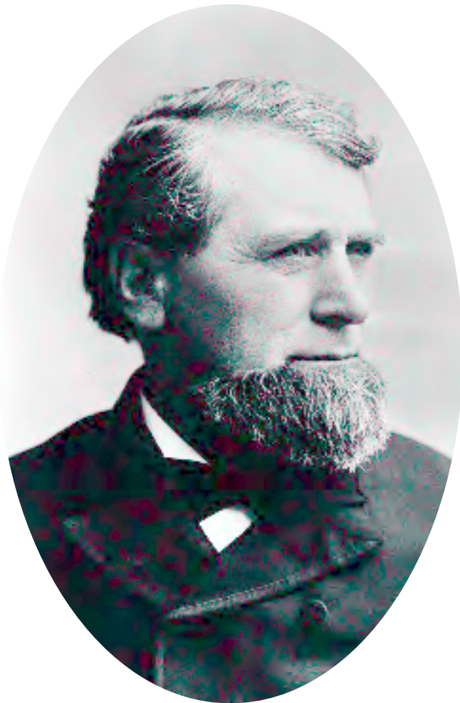
Knute Nelson, 1890s