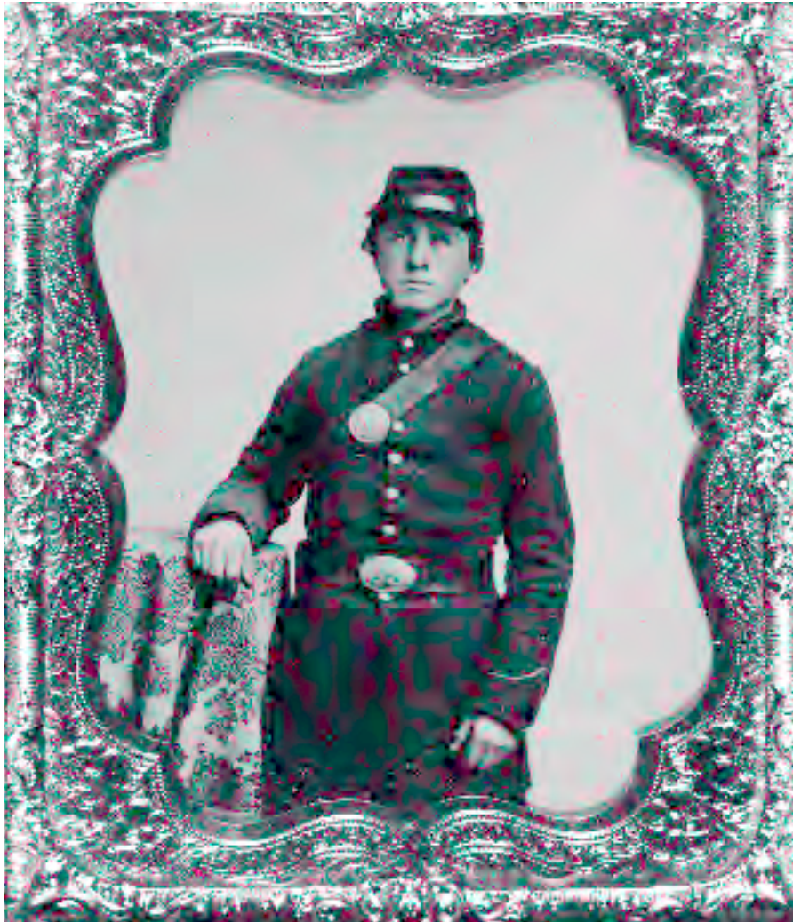
Ambrotype of Nelson, a youth of about twenty, in his Civil War uniform

tioners from Nelson's home state, wanted even greater restrictions. Some in Congress also had concluded that it was time to "close the gates." Californian Charles N. Felton made this perfectly clear to Nelson after the Minnesota representative made a seemingly innocuous reference to Norway's seafaring prowess. That small nation, Nelson asserted during debate on mail-steamship subsidies, was "one of the most successful" in terms of nautical accomplishment. Felton took exception to this statement, describing Norway's poor standard of living as "the cheap and the nasty." He then asked why one of Nelson's committees had not produced a bill "to prevent objectionable immigration." Nelson responded by accusing Felton of letting his typically West Coast hatred of the Chinese carry over