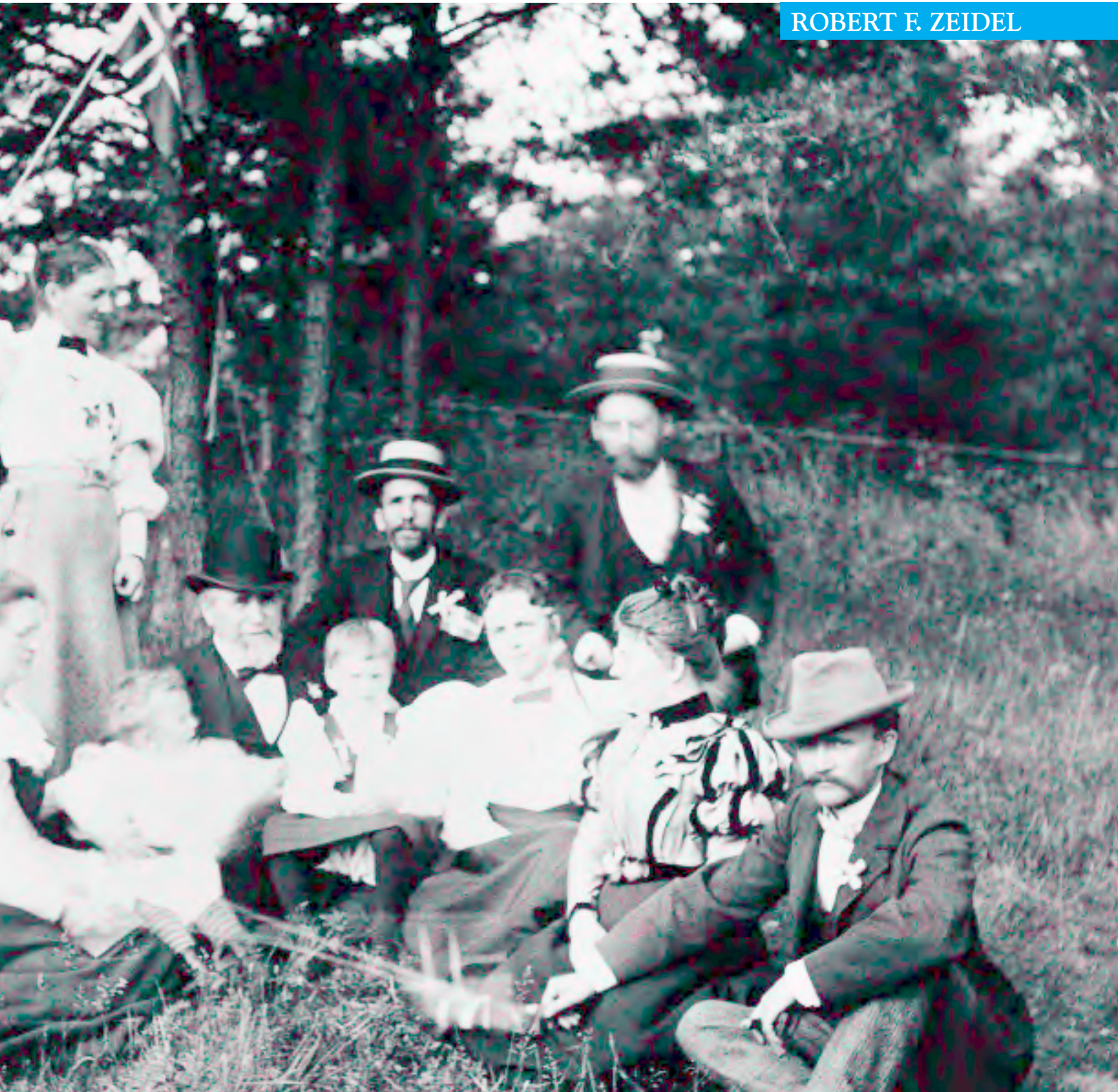
Immigrant politician Knute Nelson (seated with child on lap), celebrating his Norwegian heritage with his family, probably near his Alexandria home