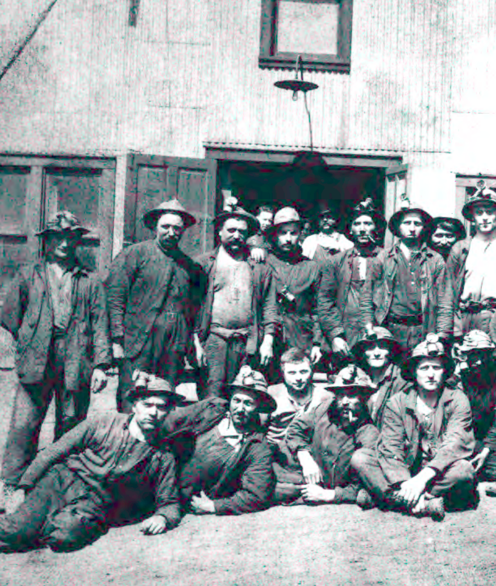
Italian American and Finnish American workers at the Lincoln mine near Virginia, Minnesota, about 1912